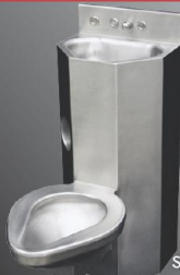
Combination Sink and Toilet