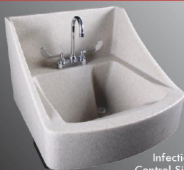
Infection Control Sink