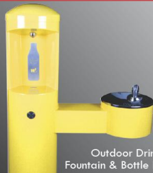
Outdoor Drinking Fountain & Bottle Filler